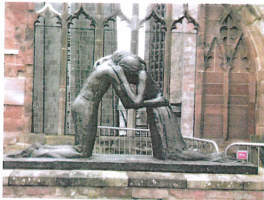
"Reconciliation": Coventry Cathedral; Coventry, England

Making disciples of Jesus Christ for the transformation of the world