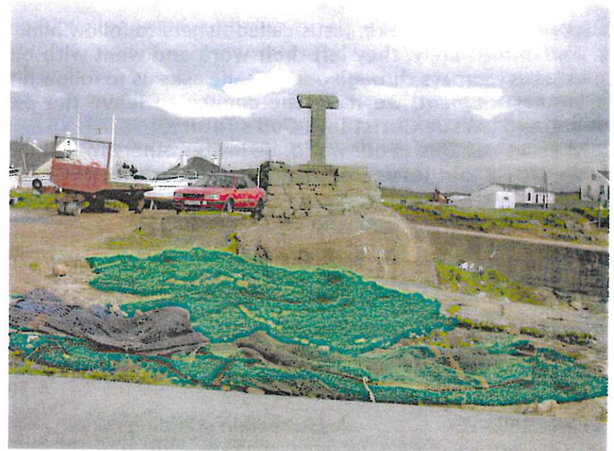
Slí Thoraí, Republic of Ireland

ASBURY UNITED METHODIST CHURCH JANUARY 26, 2020; 10:15 A.M. Making disciples of Jesus Christ for the transformation of the world