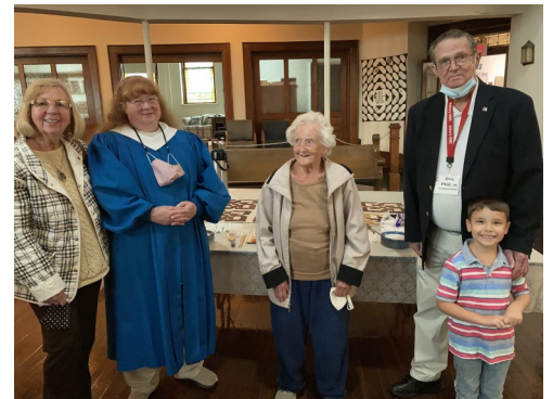
These in our Asbury Family, pictured above, will be celebrating a birthday in October. We all enjoyed cake in their honor after worship on 10/3.