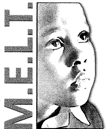
Malawi Early Literacy Team