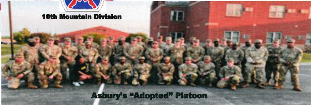
Asbury's "Adopted" Platoon

A platoon from Alpha Company, 210th Brigade Support Battalion, 10th Mountain Division at Fort Drum.