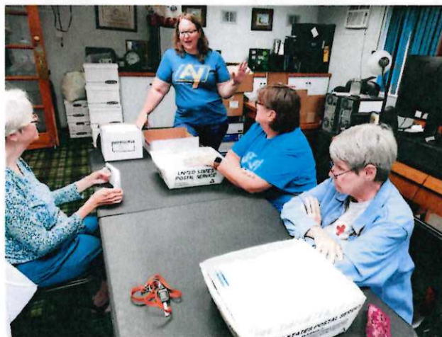
Ladies of Asbury Women of Faith helping to prepare Chapin Living Waters' newsletter for mailing.

Next Men's Breakfast: Saturday, Sept. 9th, 8:00 a.m. at IHOP