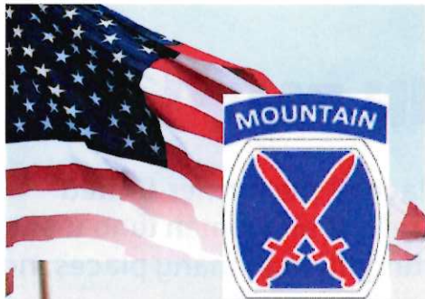
10th Mountain Division