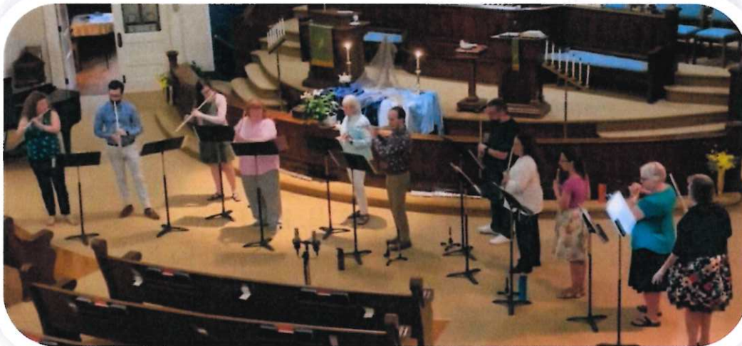
Silver Tones Flute Choir brought beautiful instrumental sounds to our sanctuary during worship on Sunday, August 20th