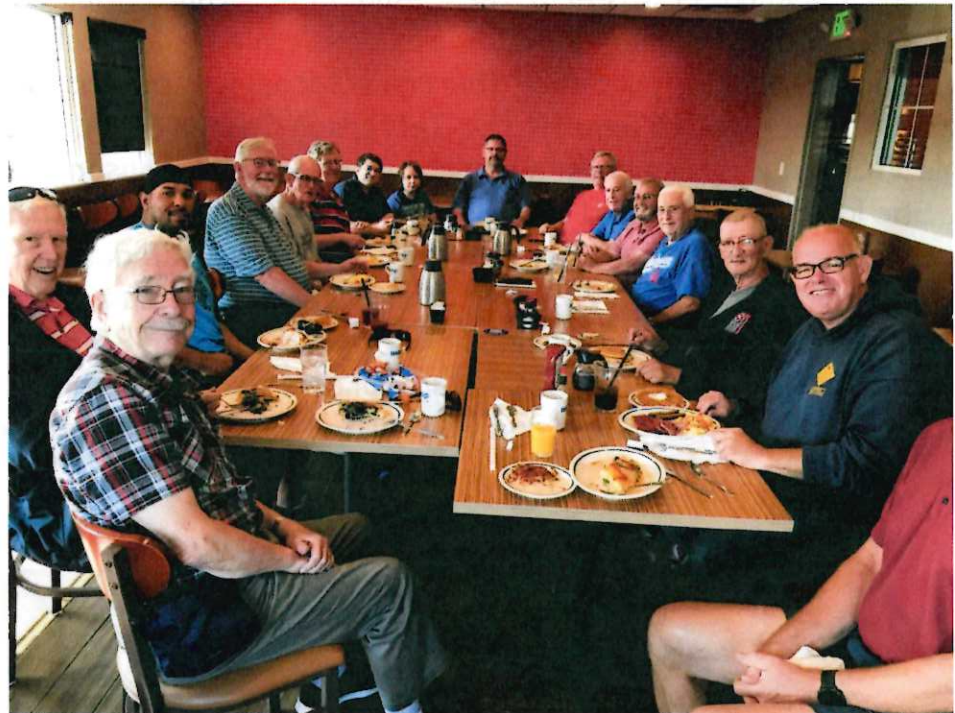
Men's Breakfast August 5, 2023 at IHOP

There always seems to be a lot of talk in churches about Fellowship and its importance. When I think of Fellowship, I always think of it as that time after worship when the congregation gathers for coffee and cookies and conversation. So, I looked up the definition of fellowship. Fellowship is defined as "a community of interest, activity, feeling or experience." Everything we do at Asbury would fit into that category, including worship. Throughout this newsletter you will find activities and experiences where the Asbury community comes together to fellowship. Find the opportunities that interest you and come join in!