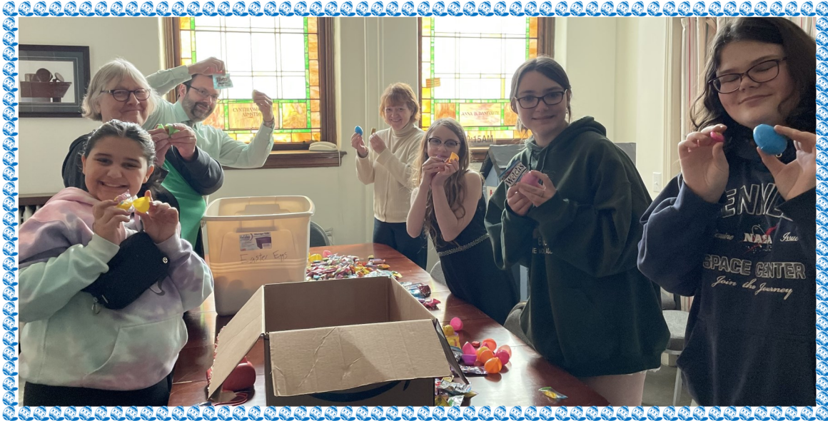
Asburians help the Easter Bunny by filling the eggs.

No Matter Where You Are on Life's Journey, You Are Welcome Here!